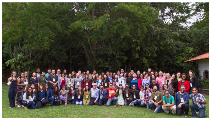
Participants in the Symposium on Wildlife Health- New Paradigms and Approaches

Brazil has a wide and growing range of wildlife-related disease issues impacting biodiversity conservation, domestic animal and public health. The Wildlife DRA process and tools provide a systematic, multi-stakeholder and science-based approach to the identification and assessment of wildlife-associated disease risks and their mitigation. Using three pre-prepared case studies based on current Brazilian wildlife disease concerns, the workshop took a 'teach-practice-apply' approach. Two case studies were used to teach and practice the DRA methodology and the final two days applied the learning to a third case (disease transmission from domestic dogs to wild canids) for which a full DRA workshop is planned in 2018. Instructional videos on the capabilities and application of the disease risk assessment modeling tool "Outbreak" prepared by Dr. Bob Lacy, with assistance from Sara Sullivan and Dr. Phil Miller, were viewed by participants prior to the workshop and followed up with a Q&A session via a satellite connection to Bob and Phil during the workshop.