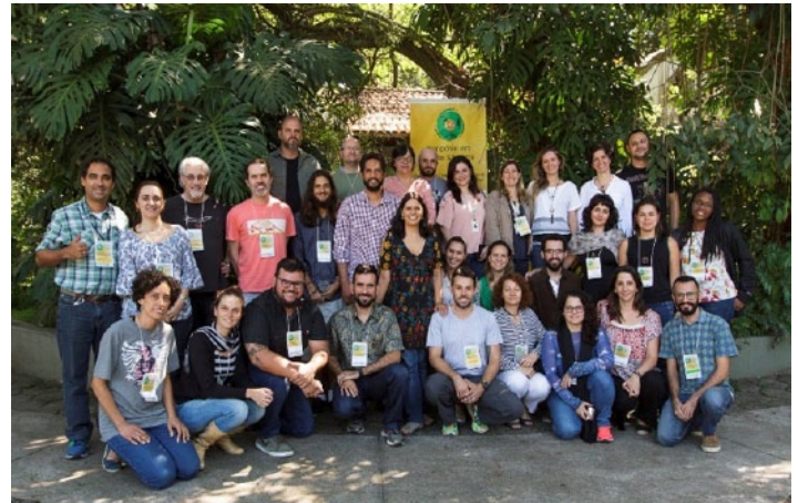
DRA Training Workshop Participants